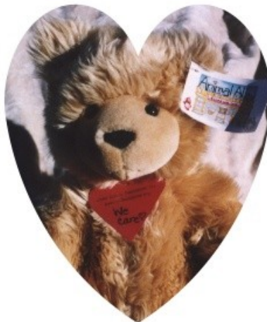
Photo of bear tagged/Sample